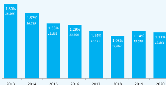
Proportion of children in New Zealand with a substantiated finding